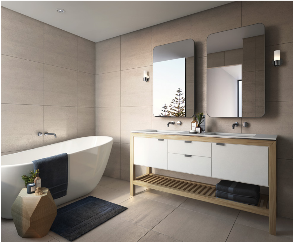
Above - Artist impression. Dawn finishes shown.

From the foyer to the finishing touches in the kitchen, every detail is considered for function and enjoyment.