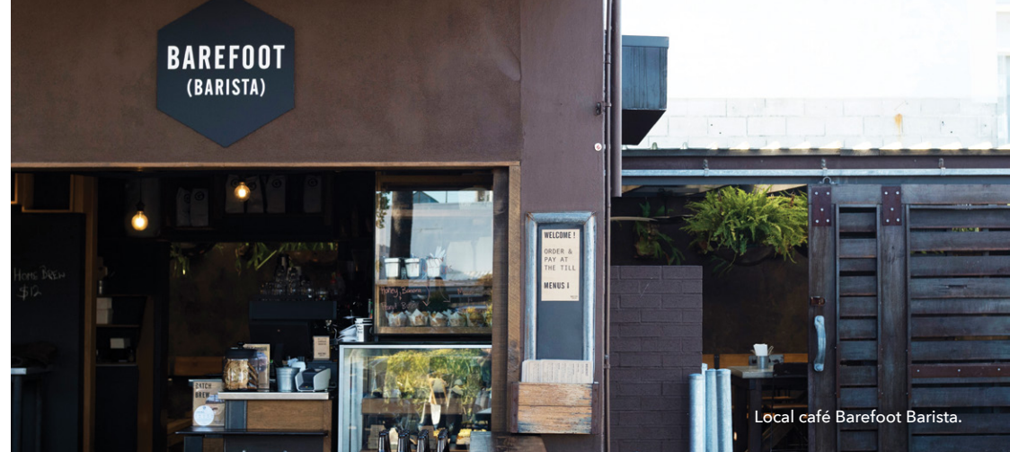
Local café Barefoot Barista.