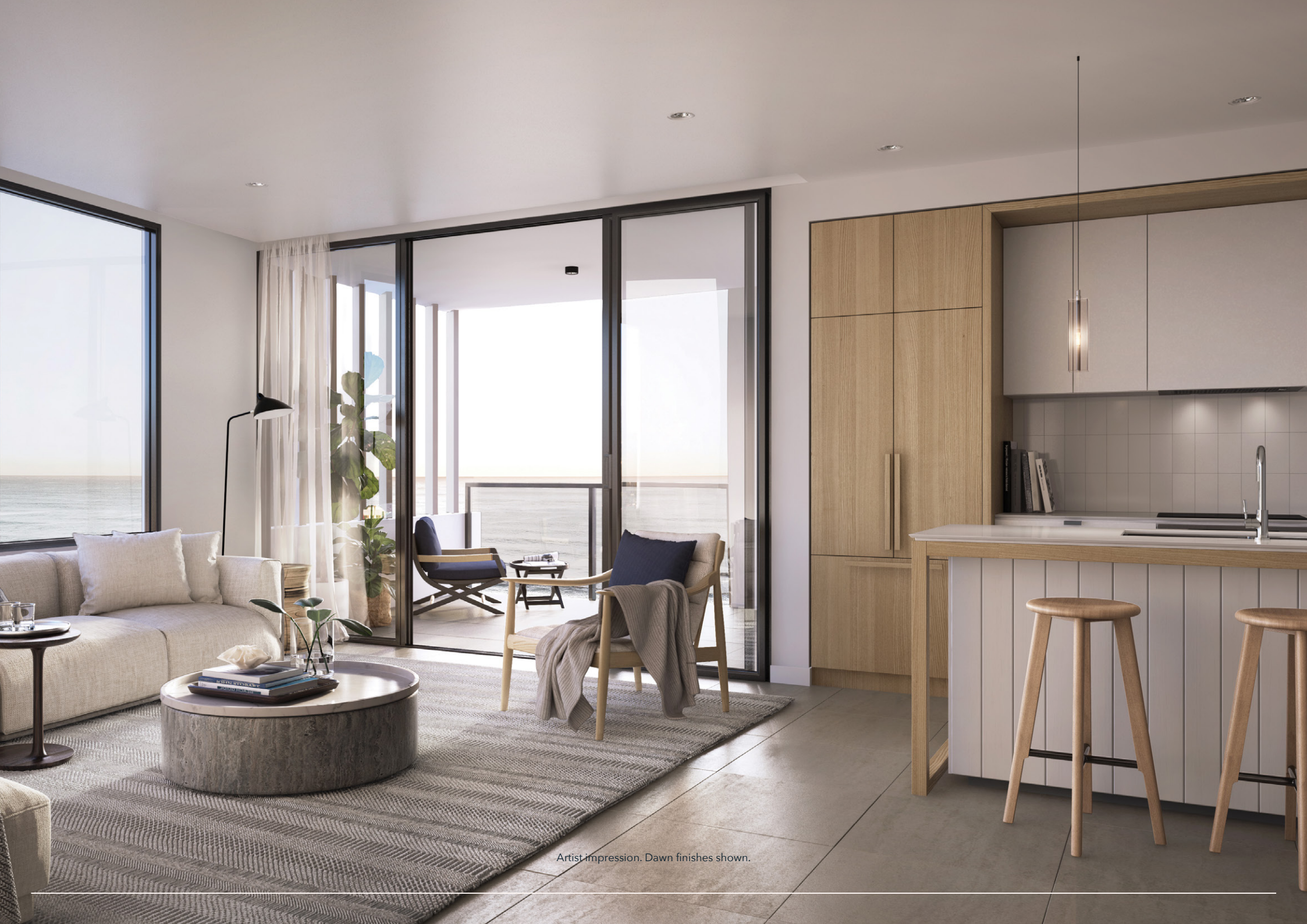
Artist impression. Dawn finishes shown.