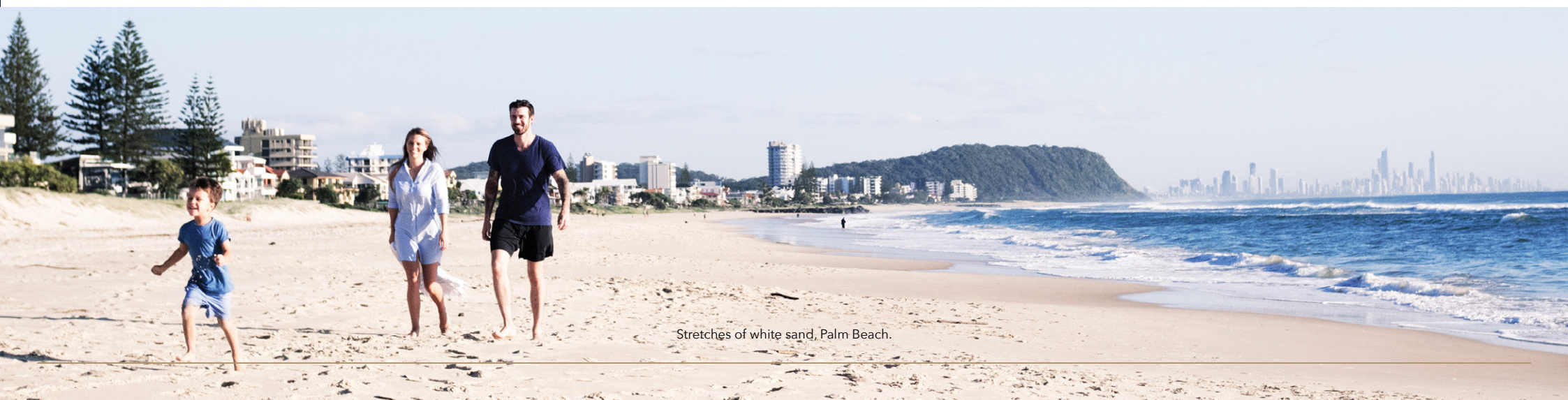
Stretches of white sand, Palm Beach.