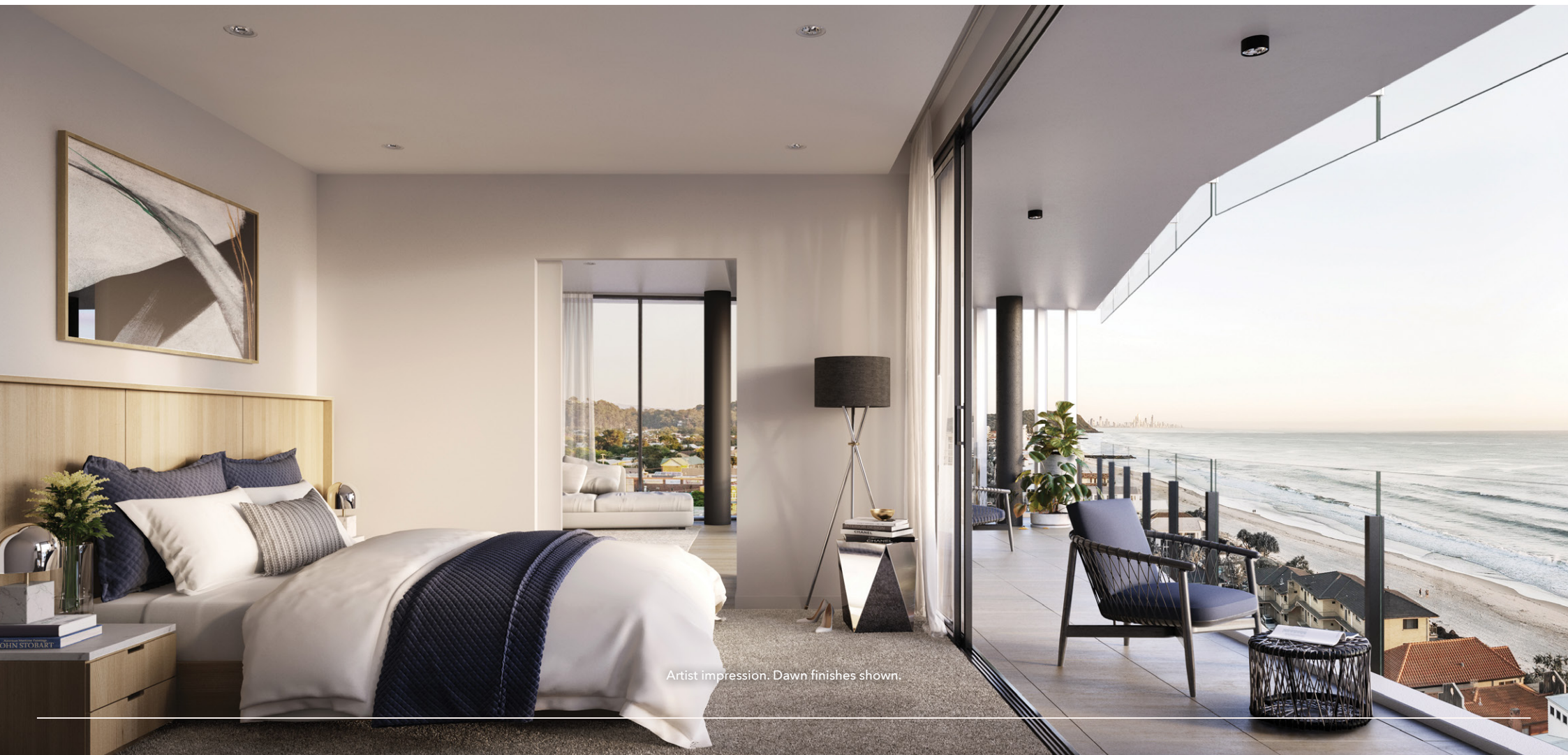
Artist impression. Dawn finishes shown.