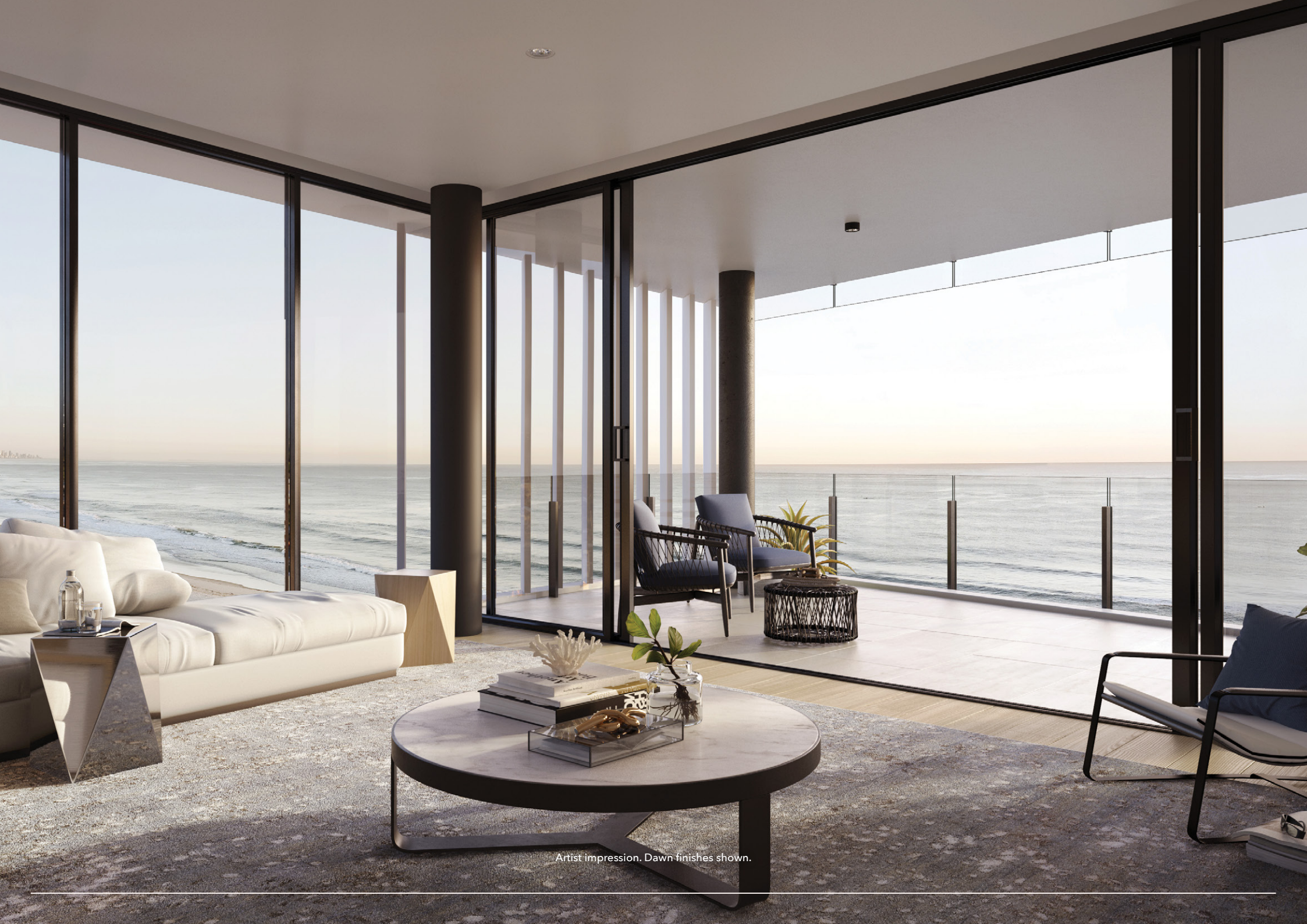
Artist impression. Dawn finishes shown.