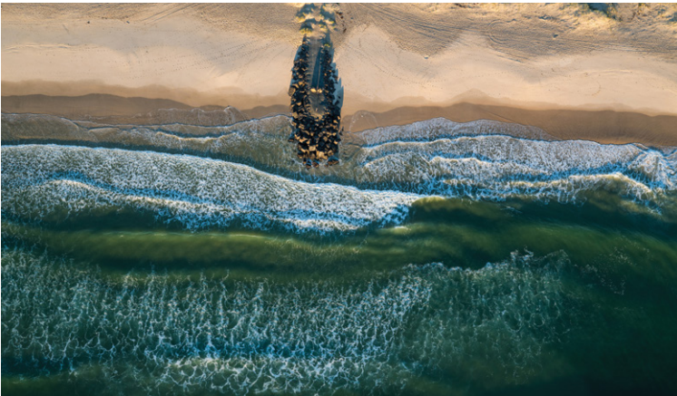
Above - Sunrise at Palm Beach