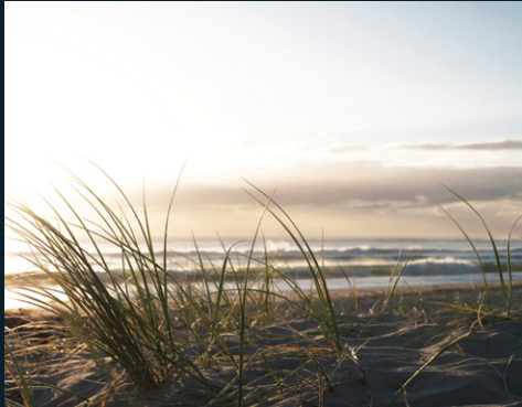
Top left - Rooftop at The Collective. | Bottom left - Palm Beach at sunrise. | Right - Perfect Palm Beach.