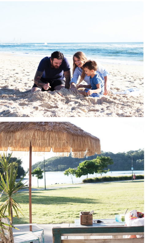
Left - Balboa Italian. | Top right - Family time at Palm Beach. | Bottom right - Dune Café.